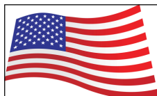
United States Flag (Old Glory)